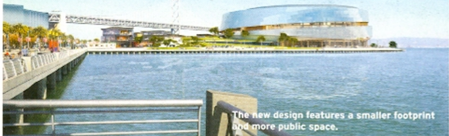
The new design features a smaller footprint and more public space.