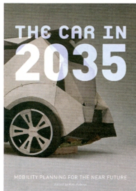
CIVIC PROJECTS FOUNDATION

CAR TROUBLE? continued from page 15 "Possible Futures: Southern California in 2035," states: "This book does not deal directly with many radically alternative scenarios, including severe global depression, permanent drought in the Southwest, The Big One (massive earthquake), Peak Oil, and rapidly rising sea levels due to climate change. However these possibilities shouldn't be ignored."